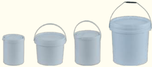
Paint Container (1)