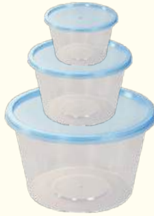
Tiny RO Container