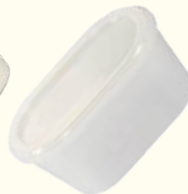
Ice Cream Cont. 4