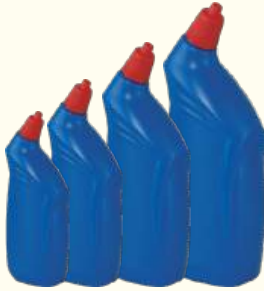
Toilet Cleaner Bottle