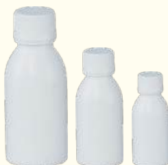
HDPE Syrup Bottle