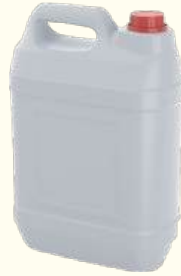
Liquid Handwash Gallon