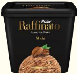
Ice Cream Sq Cont.