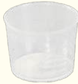
Measuring Spoon & Cup