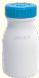
Vitamin Tablet Bottle (1)