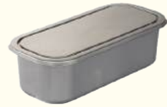
Ice Cream Cont. 1