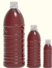
Mustard Oil Bottle