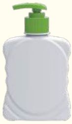
HDPE Handwash Bottle