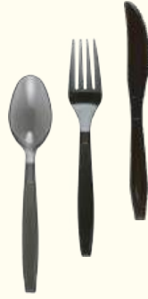
Dispo Spoon, Fork, Knife