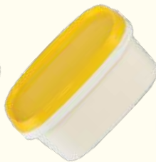
Ice Cream Cont. 3