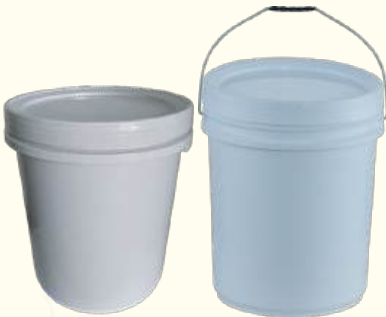
Paint Container (2)