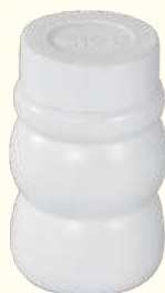
Vitamin Tablet Bottle (6)