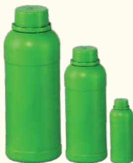
HDPE Round Bottle