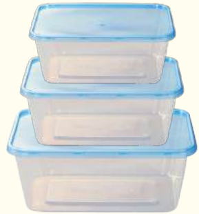
Tiny RTG Container