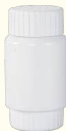
Vitamin Tablet Bottle (2)