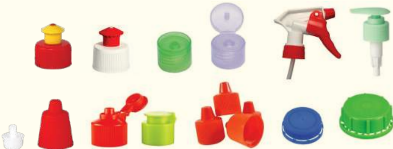
Cap, Closer & Pump