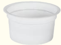
Ice Cream Cup