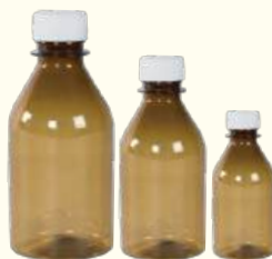
PET Syrup Bottle