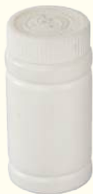
Vitamin Tablet Bottle (3)