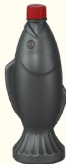
Fish Shape Bottle