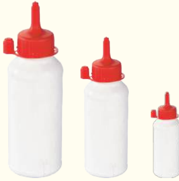
1k Pur Bottle