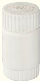
Vitamin Tablet Bottle (4)