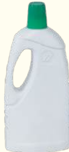
Floor Cleaner Bottle