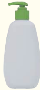
Liquid Handwash Bottle