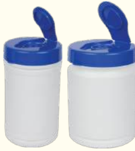
Wet Tissue Jar