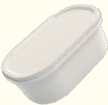
Ice cream Cont. 2