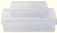
Soan Papri Box